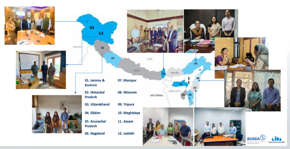
Figure 3: Meetings with State Secretaries and Directors of key public departments